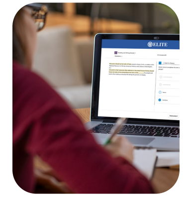
Make sure you're prepared for the digital SAT with Elite's new full-length digital practice tests

Please contact us for tuition and program details.