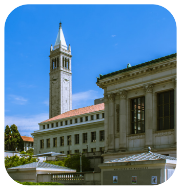
Thousands of families have trusted Elite to guide them into their top-choice UC schools

2022-23 Acceptance Rates UCLA | 9% UC Berkeley | 11% UC Irvine | 21% UCSD | 24% UCSB | 26%