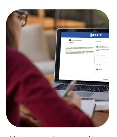
Make sure you're prepared for the digital SAT with Elite's new full-length digital practice tests

Weekly TestingFriday4:00pm-7:00pmWeekly ClassSaturday10:00am-1:00pm