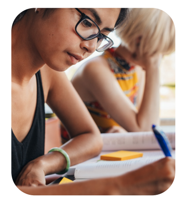
Strong ACT scores help students stand out at both test-required and test-optional schools

Weekly Class Tuesday-Friday 3:45pm-5:45pm PT